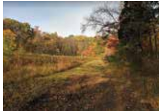
Round Mountain Meadow, Woodchurch Road

Cushetunk Nature Preserve – 8-acre addition by South Branch of the Rockaway Creek