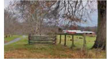
Barrettstown Joy Farm, Lamington Road

For more information, please contact our Agricultural Advisory Committee by reaching out to preserve@readingtontwp-nj.org .