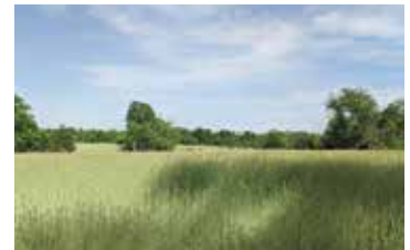
Saums Farm, Rockafellows Mill Road